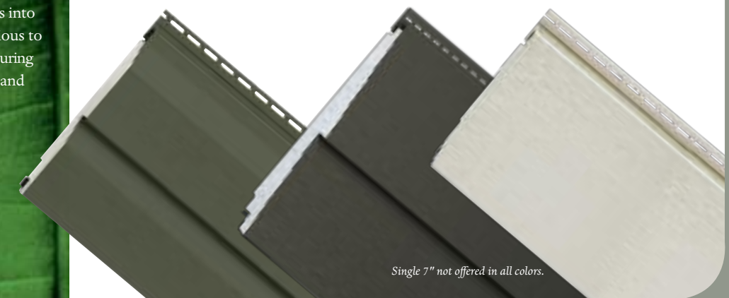
Single 7" not offered in all colors.